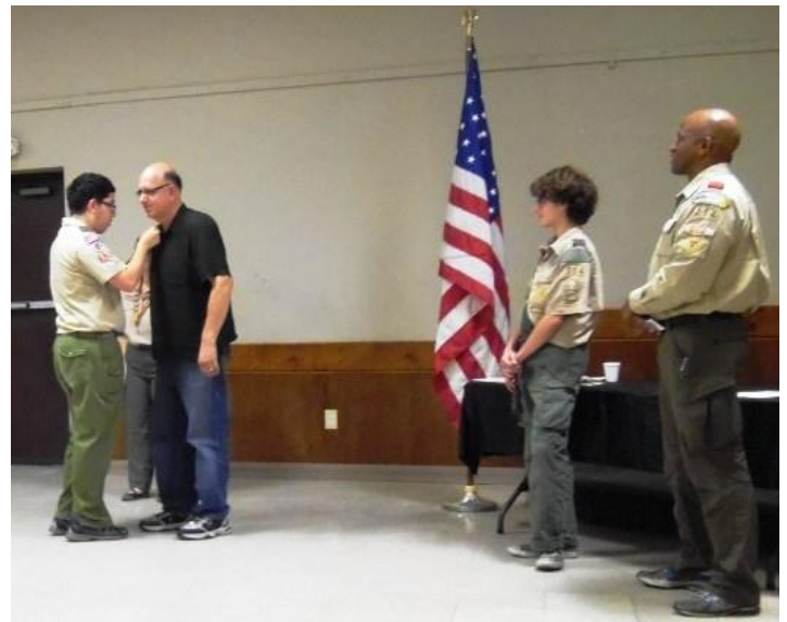
Dad gets pin.