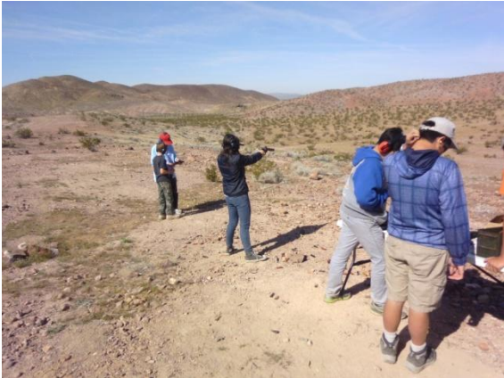
The firing was all down hill

This was a well coordinated event – all three family groups traveling separately - after driving for an hour and a half met up within minutes at the Del Taco outside of Barstow. Kind of a miracle!