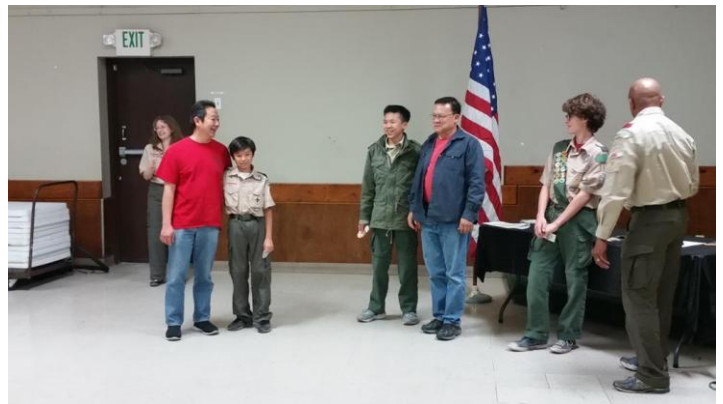
Proud Scouts and Dads