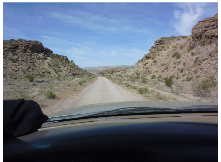
The drive out