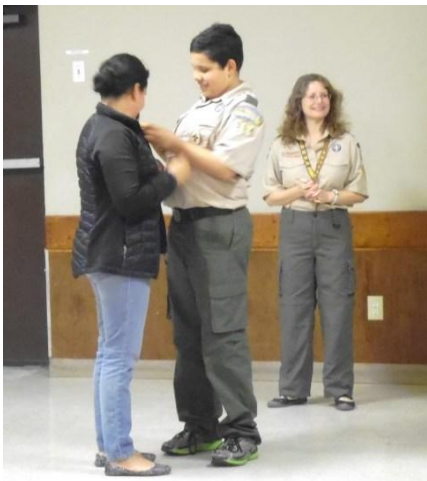
Pin on Proud Mom