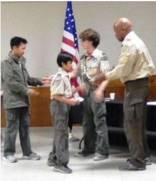
But there is more...